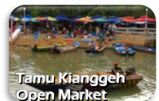
Tamu Kianggeh Open Market