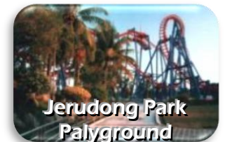
Jerudong Park Palyground