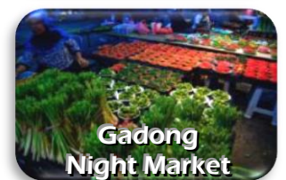
Gadong Night Market