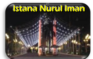
Istana Nurul Iman

In the evening, proceed for your dinner at a local restaurant, followed by Brunei By Night Tour – Drive pass the Istana Nurul Iman (Sultan's Palace) and photo stops at the Sultan Omar Ali Saifuddin Mosque & James Asr Hassanal Bolkiah Mosque . Next, visit the Gadong Night Market – a famous local night bazaar where you will find lots of local delicacies, fruits and clothing. Thereafter, visit the Jerudong Park Playground and enjoy some fun rides and games. Overnight in Bandar Seri Begawan.