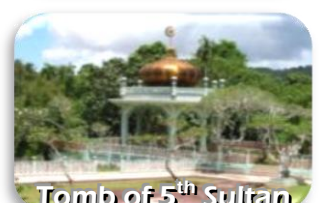
Tomb of 5 th Sultan

After your lunch at a local restaurant, visit the Royal Regalia Centre followed by a Water Taxi Ride to the Water Village along the Brunei River, visiting a stilt house where local cakes and tea will be served. Next, visit to the newest mosque – Jame Asr Hassanil Bolkiah Mosque and your tour will end with a final photo stop at the Istana Nurul Iman (Sultan's Palace). Thereafter, transfer back to your hotel for a short rest and freshen up in the late afternoon. In the evening, your private chauffeur will pick you up for your dinner at a local restaurant. Overnight in Bandar Seri Begawan.