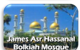
James Asr Hassanal Bolkiah Mosque

After breakfast, you will have the rest of the day free at leisure until your departure transfer to Brunei International Airport . And we wish you an enjoyable trip, bringing home fond memories of Brunei – A Kingdom Of Unexpected Treasures.