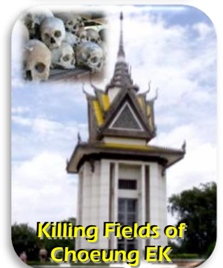
Killing Fields of Choeng EK

NOTE: Your private chauffeur will pick you from your hotel approx. 2 to 2.5 hours before your scheduled flight departure (depending on your hotel's location). Kindly check-out 30 minutes before your pick-up time to avoid any delay.