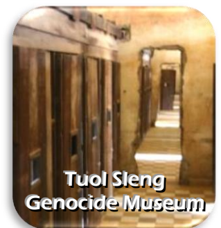
Tuol Sleng Genocide Museum

After your lunch at local restaurant, visit the Russian Market (Psah Tuol Thom Pong) and the Central Market (Psah Thmey), a lively outdoor market where you will find antiques, silver and gold jewellery, gems, silk, kramas, stone and wood carvings, as well as T-Shirts, CDs and other souvenirs. Thereafter, enjoy your dinner in a local restaurant before you retire for the day.