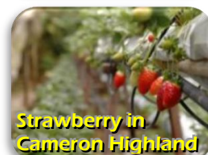
Strawberry in Cameron Highland