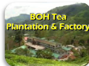
BOH Tea Plantation & Factory

After breakfast, check-out and take a boat to Kuala Tahan for your journey to Cameron Highlands via Kuala Lipis with Rubber Plantation visit en-route. Upon arrival in the evening, check-in & overnight in Strawberry Park Resort, Cameron Highlands (Studio Suite).