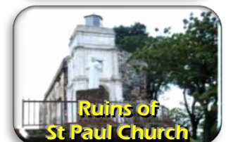
Ruins of St Paul Church