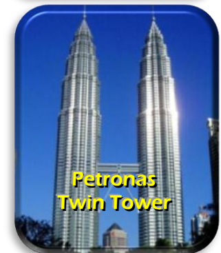
Petronas Twin Tower