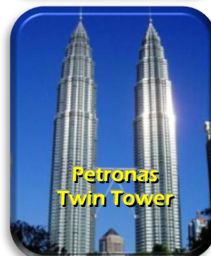
Petronas Twin Tower

After breakfast, you will proceed for your KL City Tour . This is a must for first time visitors to Kuala Lumpur – an interesting tour which unveils the beauty and charm of the old and new Kuala Lumpur, starting from where the city began, which is at the confluence of two rivers. Visits include the King's Palace , National Monument and the superb buildings at the Independence Square . Observe the contrast between historical architecture and modern skyscrapers in an abundant setting of greenery. You will also visit a local handicraft centre and photo stop at the magnificent Petronas Twin Towers . In the evening, you will depart for the Culture Night Tour . Sri Maha Mariamman Temple – The smell of burning jasmine, incessant chanting of Hindu priests, intricate carved deities and the mystical aura combine to give you lasting impression of this religion. Then, take a stroll through to open air Bazaar of Chinatown – a bazaar of numerous makeshift stalls lined up to display their wares ranging from local handicrafts to almost-as-good-as-genuine designer items. Try your bargaining skills here. Thereafter, proceed to a Malay Restaurant for buffet dinner and cultural show ; enjoy a sumptuous variety of local dishes and delicacies. Overnight in Swiss Garden Hotel & Residences, Kuala Lumpur.