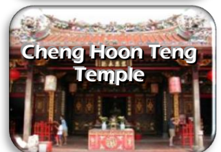
Cheng Hoon Teng Temple

Cameron Highlands – 1,542m above sea level and famous for its tea plantation and cool temperature. Not far from Tapah, a few families devote their livelihood to weaving bamboo basket used for vegetable packing. A short stop at the Lata Iskandar Waterfall and Orang Asli huts along the winding drive up the highlands. The plateau is marked by the rolling hill slopes of tea bushes. You may catch some workers collecting tea leaves. The temperature can drop to 15°C. Sweaters are recommended during evenings. Upon arrival, check-in & overnight in Strawberry Park Resort, Cameron Highlands (Studio Suite).