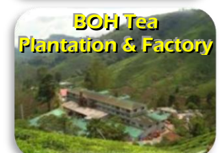
BOH Tea Plantation & Factory