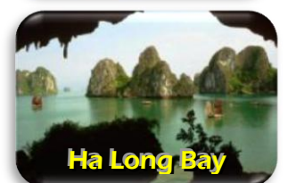
Ha Long Bay

NOTE: Your private chauffeur will pick you from your hotel approx. 2.5 to 3 hours before your scheduled flight departure (depending on your hotel's location). Kindly check-out 30 minutes before your pick-up time to avoid any delay.