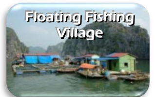
Floating Fishing Village

In the evening, the vessel will anchor at either the Trong Cave or Ho Dong Tien Cave areayou’re your overnight stay. Tonight, fresh seafood supplied by the Vong Vieng fishing villagers will be served for your dinner. Thereafter, free at leisure to enjoy the night beauty of Ha Long Bay.