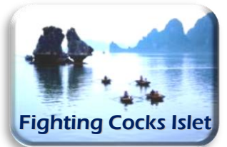
Fighting Cocks Islet

After your dinner at a local restaurant, enjoy the unique and famous traditional Vietnamese Water Puppet performance. Overnight in Hanoi.