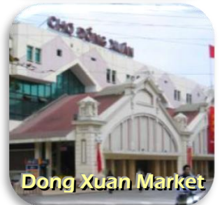
Dong Xuan Market