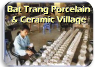
Bat Trang Porcelain & Ceramic Village

Welcome to Hanoi – the capital of Vietnam. Today will be your free day at leisure to explore the city on your own. Tonight, your private chauffeur will pick you up for your dinner at a local restaurant. Overnight in Hanoi.