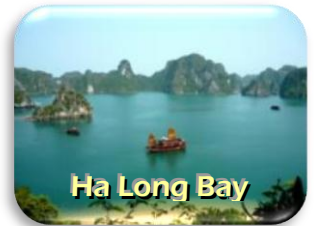
Ha Long Bay

Upon arrival at Noi Bai International Airport , you will be greeted by our tour coordinator and escorted to your hotel in Hanoi for your check-in. Welcome to Hanoi – the capital of Vietnam. Today will be your free day at leisure to explore the city on your own. Tonight, your private chauffeur will pick you up for your dinner at a local restaurant. Overnight in Hanoi.