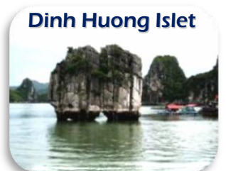
Dinh Huong Islet