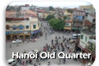
Hanoi Old Quarter

After lunch, visit the Temple of Literature , which is regarded as the first university in Vietnam. Thereafter, proceed for your 3.5 hours journey to Ha Long Bay , one of Vietnam's greatest natural wonders which is a World's Natural Heritage recognized by UNESCO in 2000. This evening, you will have a seafood dinner at a local restaurant before you retire for the day. Overnight in Ha Long Bay.