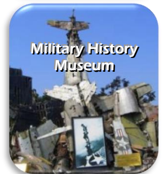
Military History Museum

After lunch at a local restaurant, visit Military History Museum – the concentrated embodiment of the spirit of Vietnamese people – "Nothing is more precious than independence and freedom". Walk through Hanoi Old Quarter where you will have time for shopping. After dinner at a local restaurant, enjoy the unique and famous traditional Vietnamese Water Puppet performance. Overnight in Hanoi.